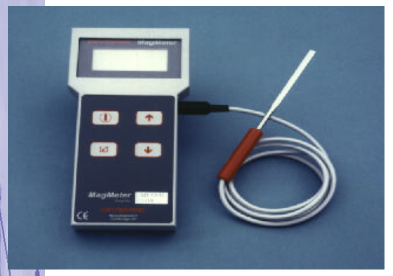
MF300H AND TRANSVERSE HALL PROBE